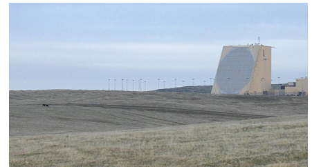
A dedicated crew provides maintenance for the RQ-4 Global Hawk, an unmanned aircraft (top). The preserved open space around PAVE PAWS allows local ranchers to use the land for grazing (bottom).